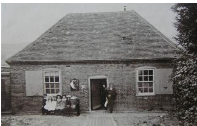
The Chapel as built in 1813.

B aptists had worshipped in Loosley Row since at least the 18 th century. Early Baptists belonged to a scattered society based at Ford in the Vale of Aylesbury, which spread over the greater part of central Buckinghamshire. With no set meeting place, worship was held in members' homes. The Ford Minute Book records meetings in Loosley Row and "The Row", as it was sometimes referred to by older folk.