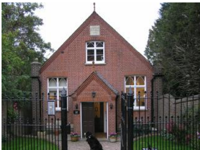
The Chapel today, with gates open

Taking on the Chapel has been her biggest challenge yet. The property was in good structural condition but was going to be a testing job. She fell for the beauty of the building and could visualise how she could convert it into a modern home while still retaining a lot of the Chapel's original features.