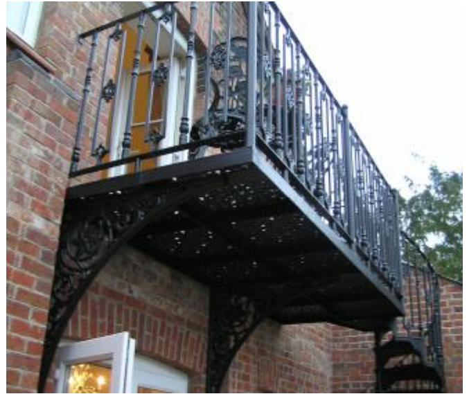
Looking up from roof garden

...and the refurbished plaque listing 100% attending Sunday School scholars from 1958-9 until 1968-9.