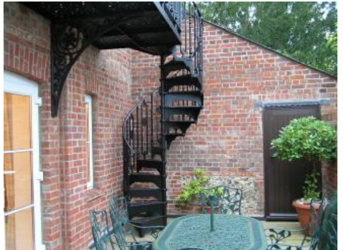
Rear external staircase down to roof garden

This window is at the foot of the stairs up to the top floor from the reception. Another is in the lobby door.