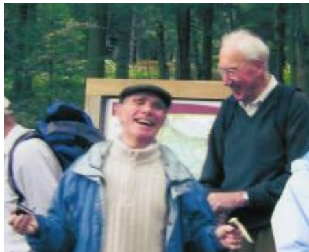
Always plenty of laughter