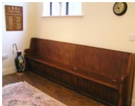
...an original pew, restored...