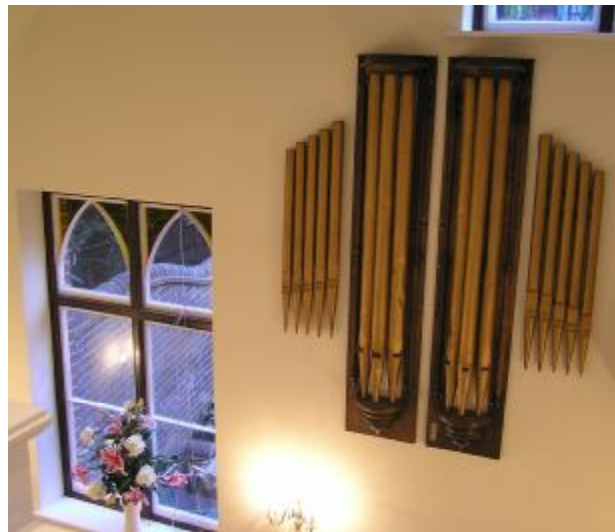
The original-height entrance area includes the Chapel's organ pipes...

The entrance hall has been left the original full height of the building to maintain the atmosphere of light and space as you enter the building. Several features of the Chapel were saved and restored and are featured in the large hall area. These include the organ pipes, an original pew and a refurbished plaque.