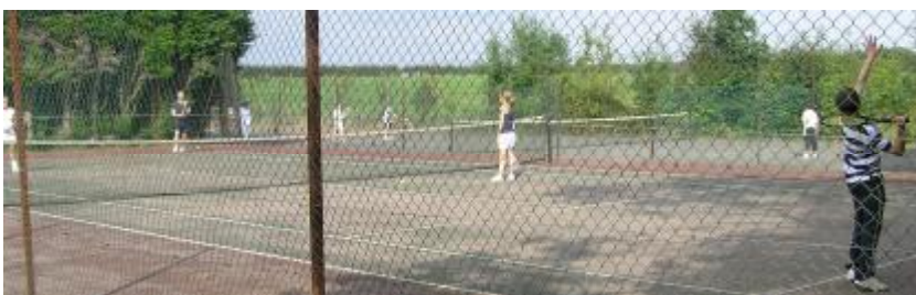
whilst plenty are enjoying playing tennis