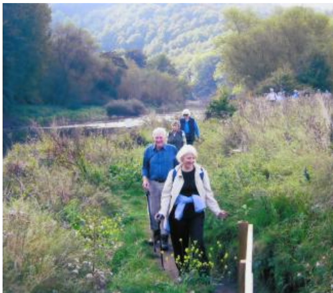
Walking alongside the river Severn

On Saturday morning, we all gathered in the woods above the Severn Valley for group photos before setting off through wonderful old trees on a path that eventually led down to the River Severn, meeting our non-walking members for a shared lunch in the pub garden as the sun shone.