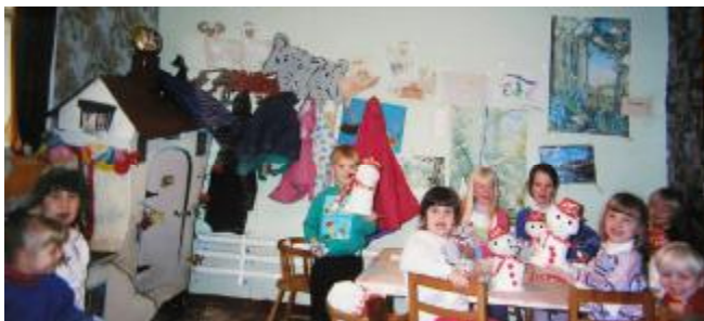
Sunday School class about 25 years ago.