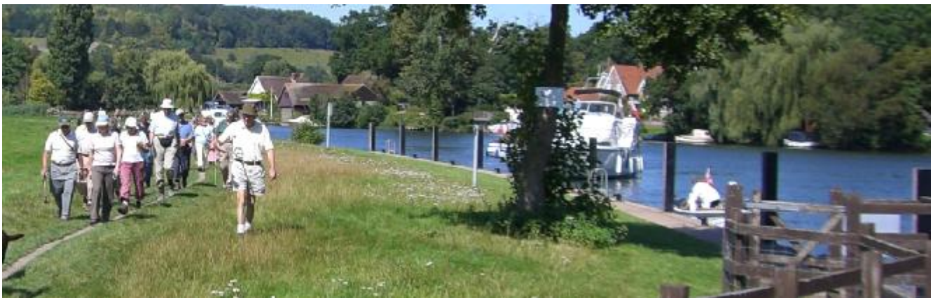
Approaching Hambledon Lock from Henley