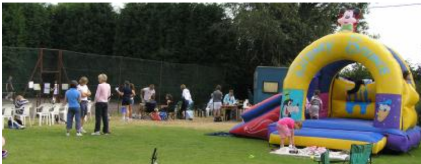
At the Tennis Tournament / Fun Day, five children on Disney Bounce at one time, DIY BBQ, eating, drinking & socializing of all ages