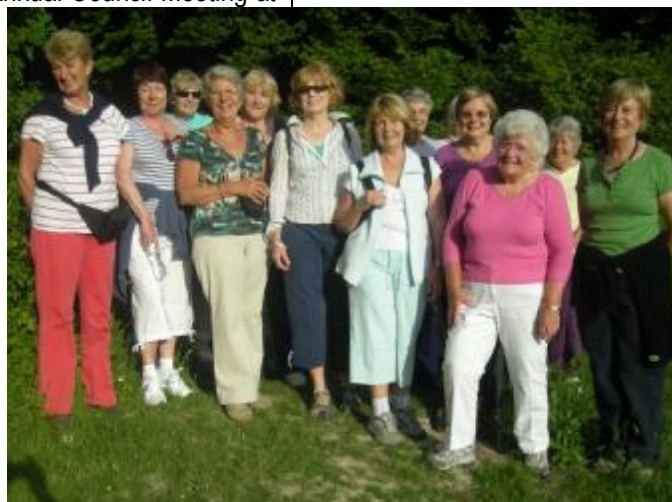
The WI ramblers take a break