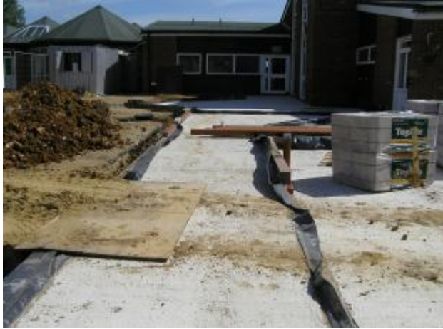
▲ The floor slab cast in concrete, showing the overall floor plan ▼