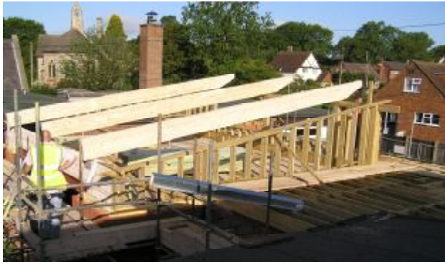
With the Glulam Beams in position, the roof structure takes shape ▼