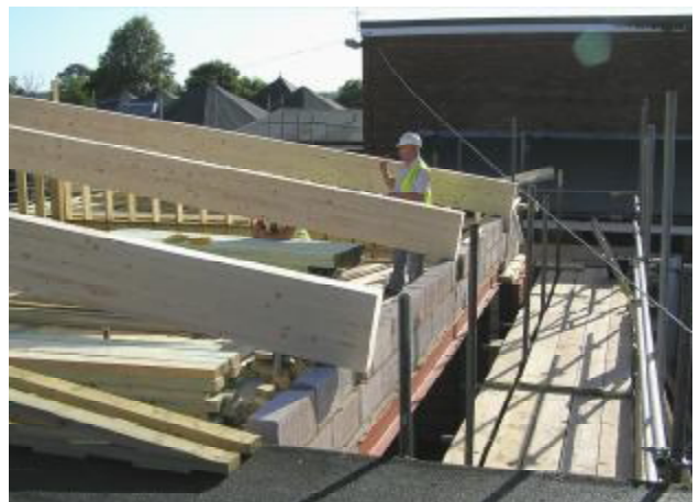
Three Glulam Beams being lifted into position to support the roof structure ▼▶