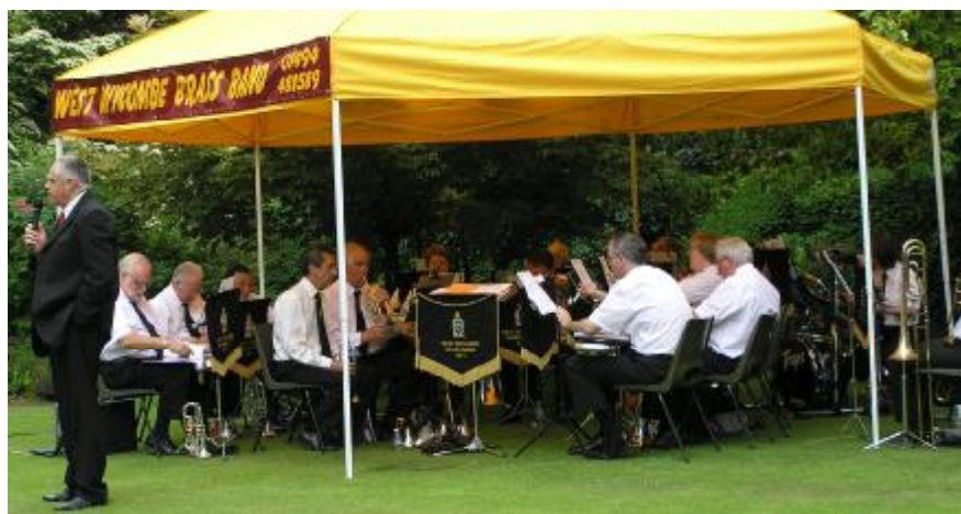
Strawberry Tea with Brass Band - a real old English atmosphere for the family