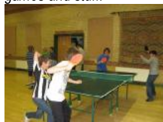
Table tennis tournament

‘It’s fun and sociable. It’s really fun and we do lots of games and stuff.’