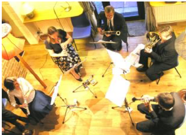
and looking down from the gallery

In the series of charitable events held at “Chipko” (on the left just past the Pink & Lily ) in recent years, the latest was a second concert in aid of Anti-Slavery International. The W5 Wind Quintet , named after the district in London where it rehearses, came on Sat June 6th and gave a performance of French classical music followed, after an interval serving Fairtrade wines, by arrangements of English folk songs and jazz. The house was indeed packed with an audience of 48 whose generosity netted an excellent result of £ 2,739, including gift aid tax recovery.