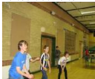
Kids Playing Volleyball

“It’s great fun and you play games. You meet new friends and old friends.”