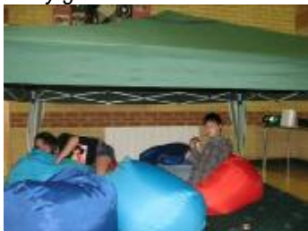
The Chill out zone

“I like hanging around with my mates in a place where we can just sit down and chill out and listen to music and stuff. It is really good.”