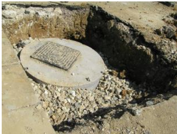
▲ There were two soak-aways filled with “reject” stones (ie stones too big for making into concrete) to leave room for rainwater in between ▼▶

Norman Herridge Ltd finished the groundwork, then the main contractor, Lindum Construction Services, took over the building work directly.