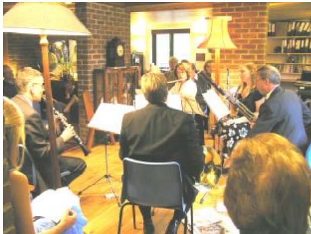
The W5 Quintet seen from ground level