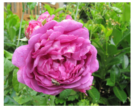
David Austin Roses