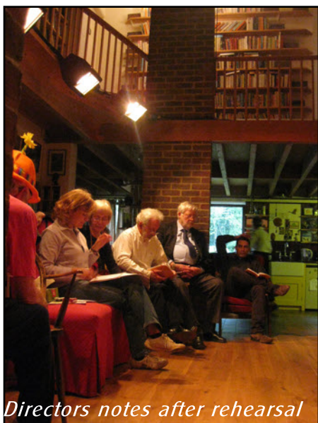
Directors notes after rehearsal