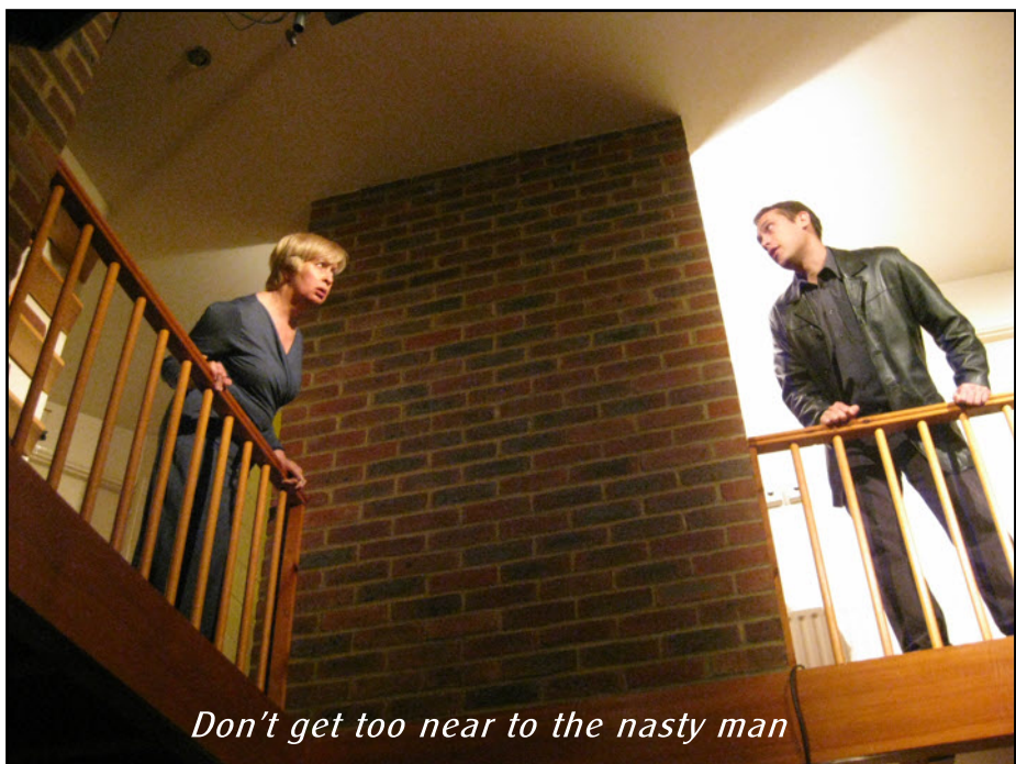
Don't get too near to the nasty man