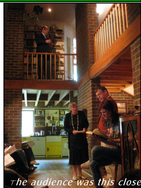
The audience was this close

The dates for the dinner theatre are Thursday, Friday and Saturday, November 25 th , 26 th and 27 th in the Village Hall.