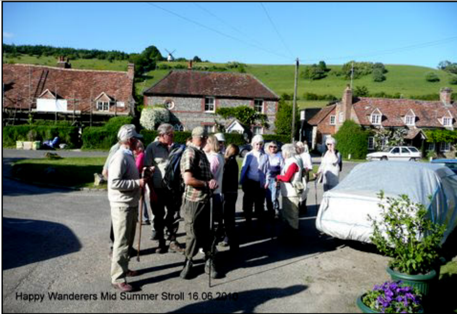
Happy Wanderers Mid Summer Stroll 16.06.2010