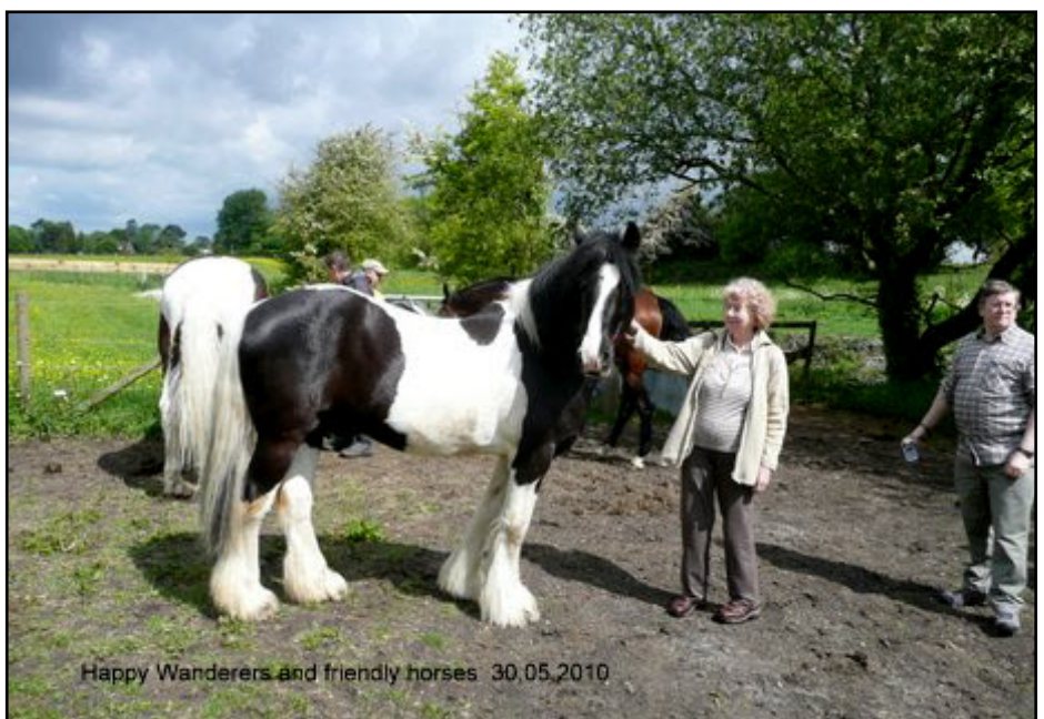
Happy Wanderers and friendly horses 30.05.2010