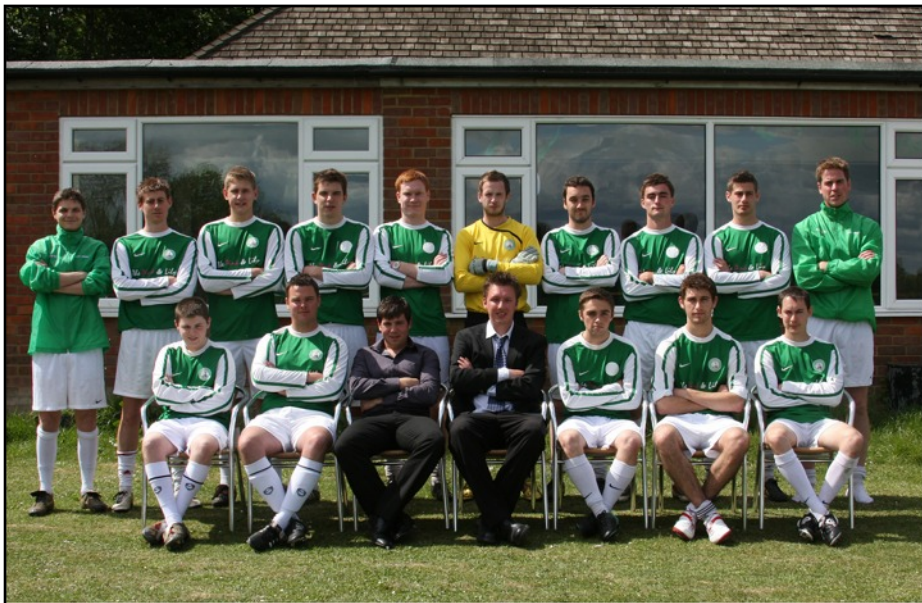
Lacey Green Football Club 2010/11

Lacey Green FC are full swing into the season, already half way through, and as always the lads keep on going to impress their success upon The High Wycombe Sunday Combination.