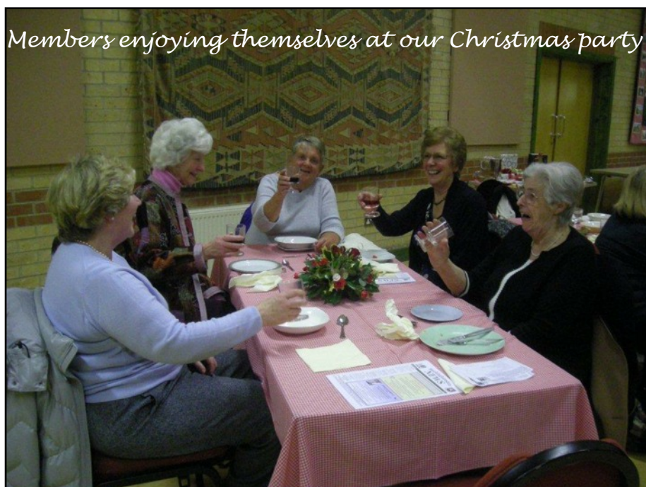
Members enjoying themselves at our Christmas party

Don't forget – we meet on the first Wednesday of each month at 7.45pm in the Village Hall - do come and join us - we're a friendly bunch!