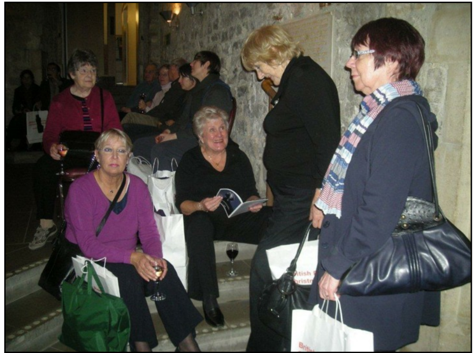
Having a well earned rest at The Guildhall

At the end of November 23 members had a great day out at the Xmas Market in the Guildhall, London. There were lots of interesting stalls and most of us came away with bulging bags!