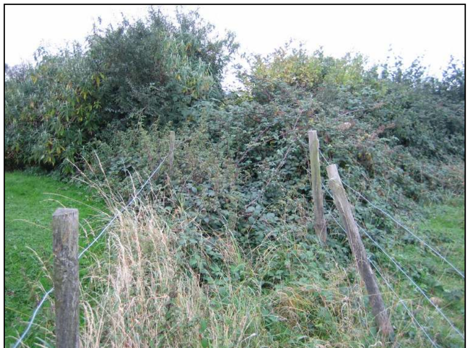
An example of a footpath in need of repair. LAG 40 obstructed by overgrown brambles