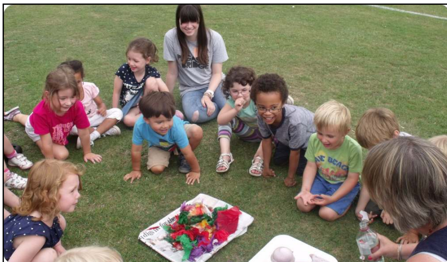
Under a Jungle tree and Erupting Volcano.

Children are left on their own with us for a creative mix of art, craft, music, games and let's pretend and, above all, fun! Parents can get ready for the half term break or just have a day out!