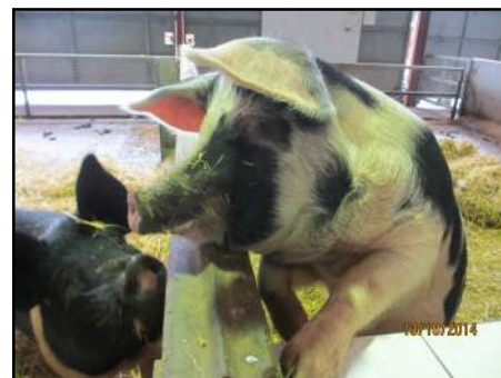
Pigs at the Model Farm

Come Monday however the programme changed slightly due to the very bad weather that had arrived overnight. Some members had to paddle to their cars in the car park and the programme proved its flexibility by allowing us to enjoy the house on the Wimpole Estate initially. Then 11 hardy walkers set off, leaving the rest to compose their own itinerary around the walled garden, home farm and excellent restaurant.