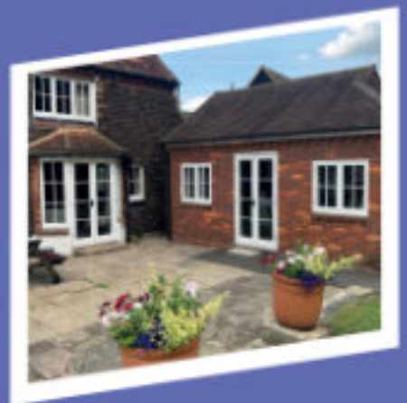
RISBOROUGH (at Hearing Dogs Site)

Transformational Hearing Care SINCE 1989