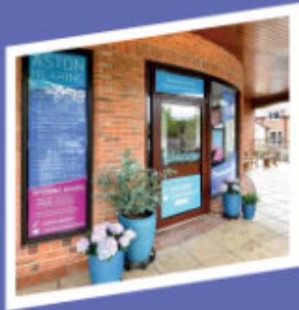
THAME (next to Waitrose)