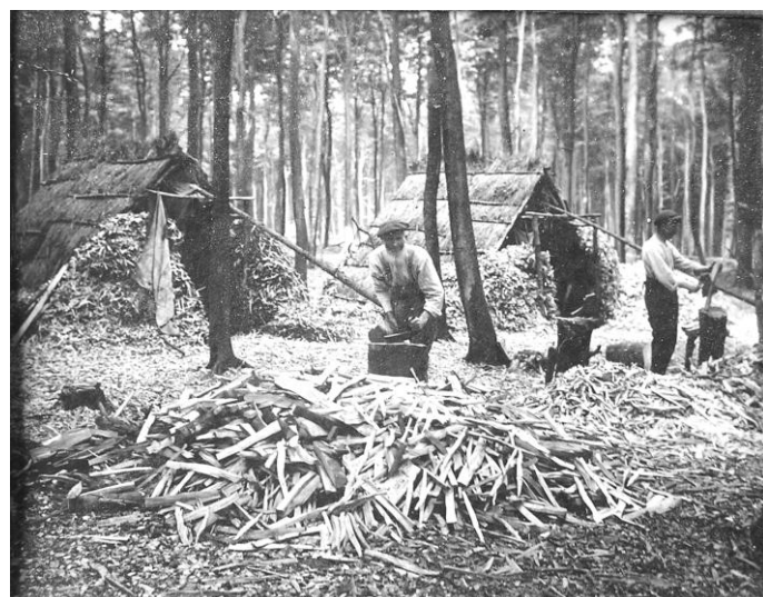
Bodgers working in the woods in Hampden

The bodgers were a cheerful and kind body of men. The kindred spirit that prevailed within the vast Hampden woods at that time was a joy to behold, and many moments of sheer delight were witnessed by two very small children.