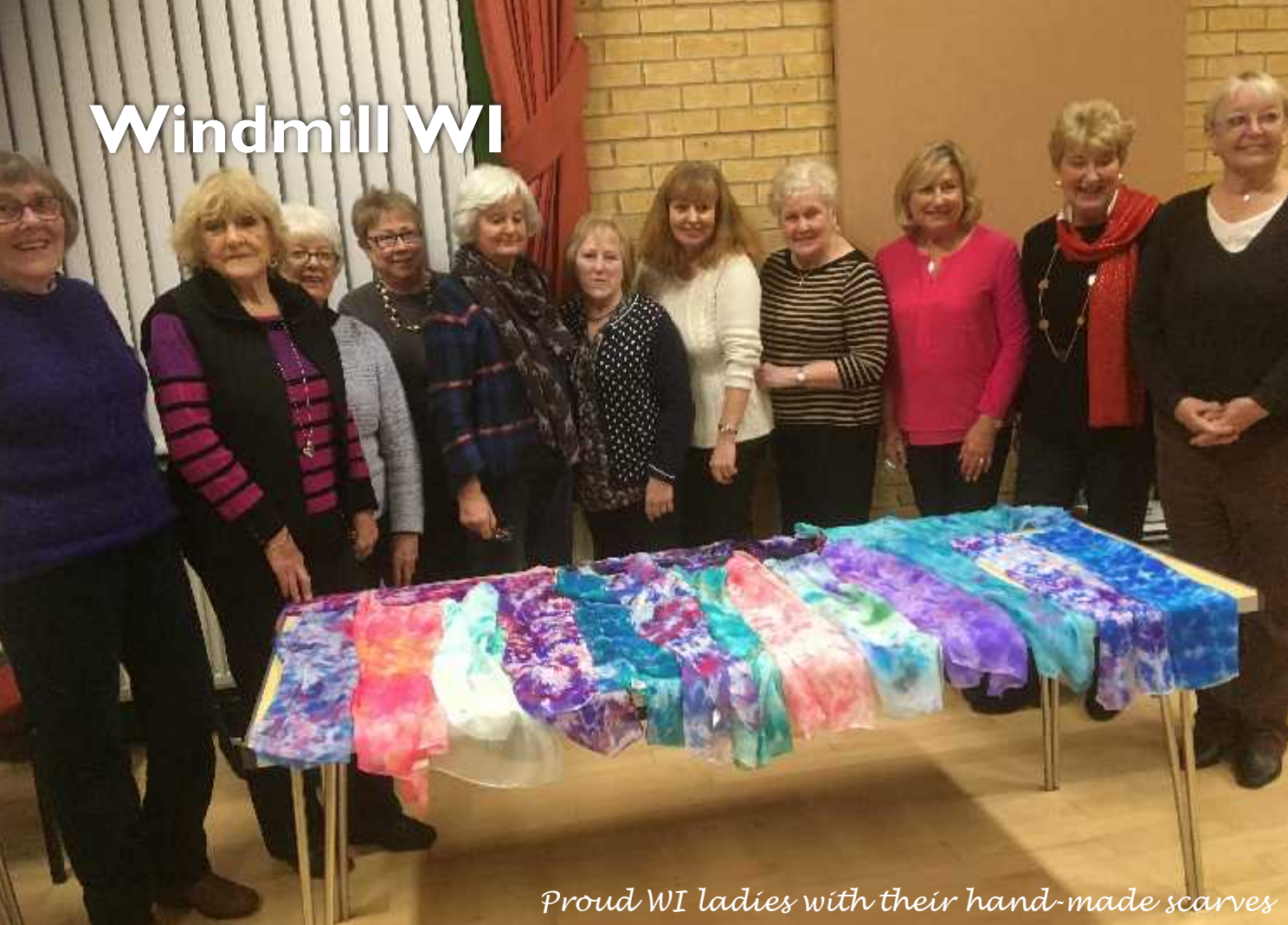
Proud WI ladies with their hand-made scarves