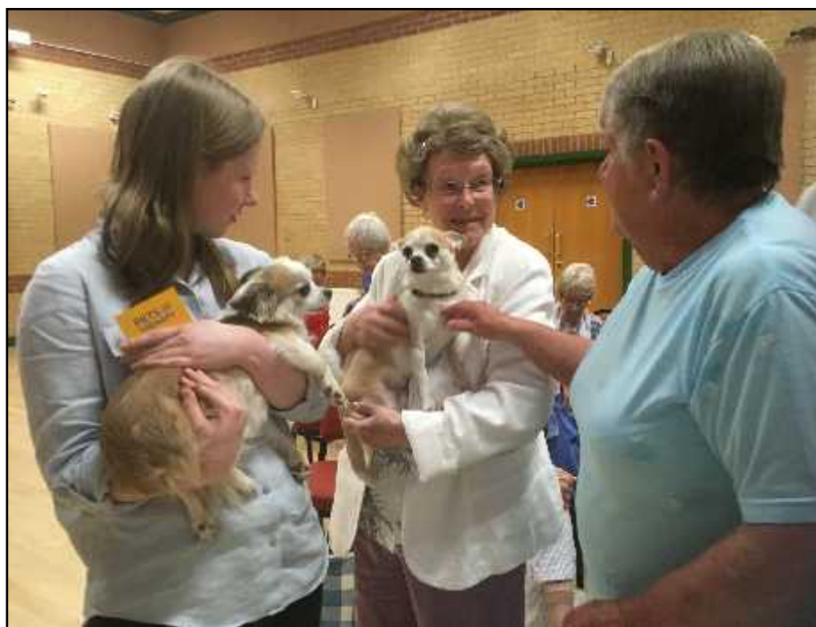
Pets As Therapy