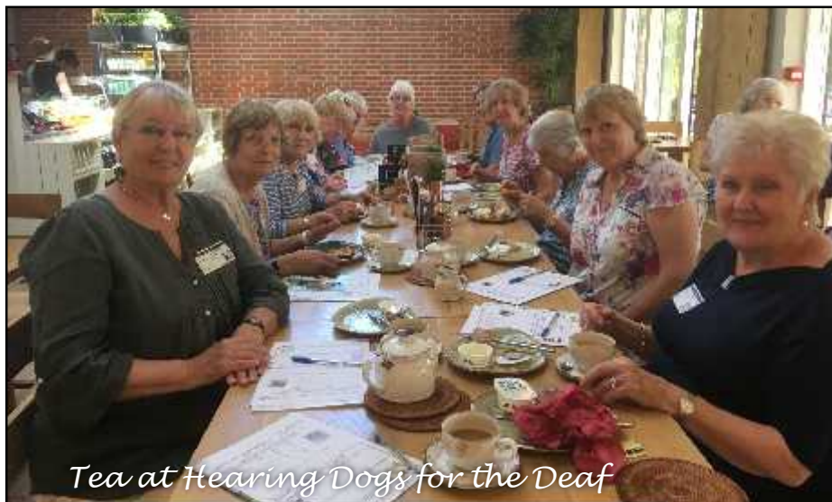
Tea at Hearing Dogs for the Deaf

Our knitting group has now made 30 baby jumpers which we