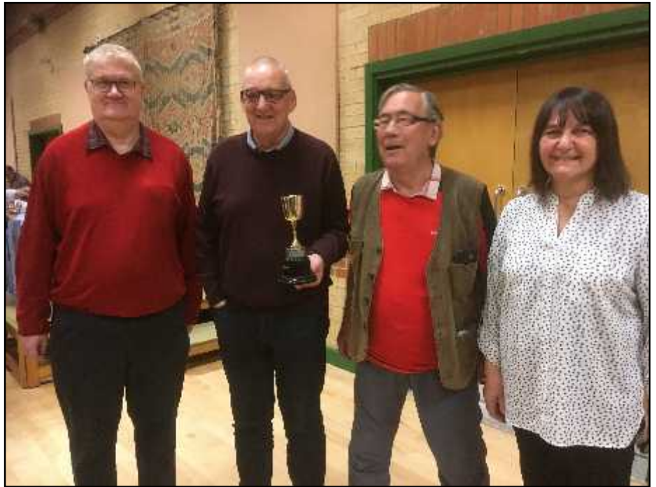
Quiz winners: The High Wycombe U3A